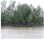
Mangrove in Meinmahla Kyun